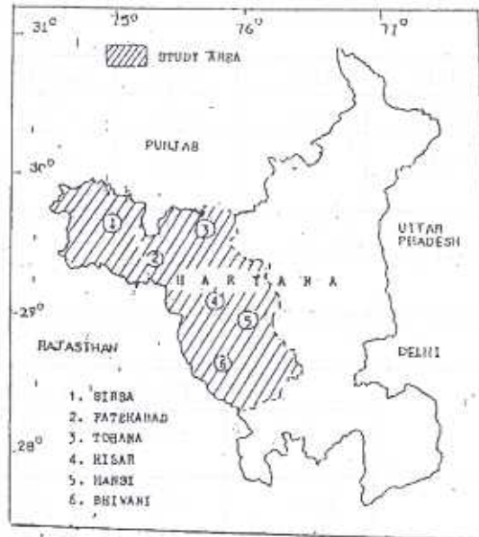
Fig. 1: Study area and location of selected rain gauge stations